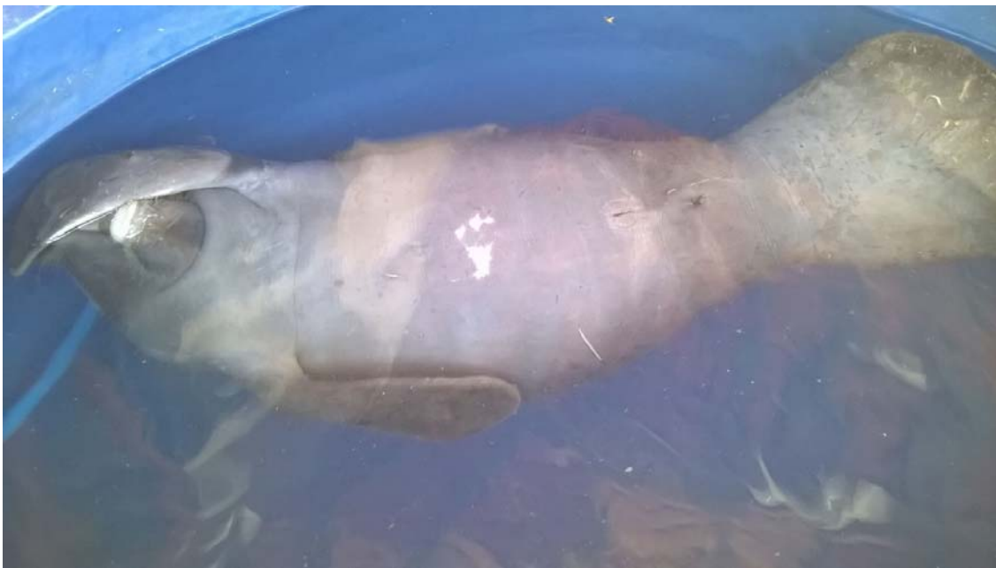
Figure 2. Vitória, the Amazonian manatee calf, in quarantine in Goianésia do Pará.