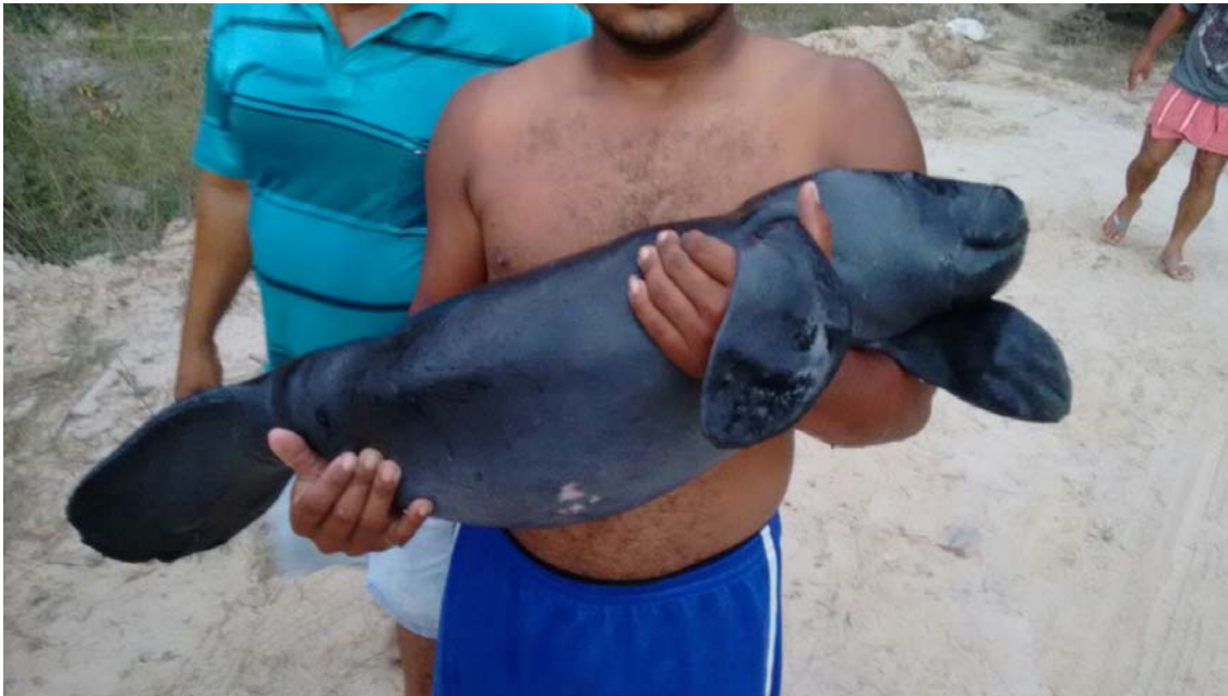
Figure 1. Amazonian manatee ( Trichechus inunguis ) calf found in a tributary of the Capim River in Goianésia do Pará, Pará state, on August 26, 2015.